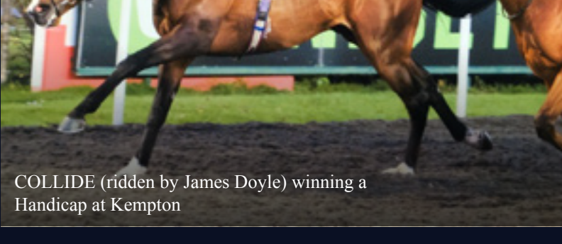
COLLIDE (ridden by James Doyle) winning a Handicap at Kempton

HEAVENLY HOLLY is a third entry for the Wokingham Handicap but, such is the strength of Ascot Handicaps now that, I think her rating of 97 is likely to be insufficient to gain a run, and she will need to win between now and next Saturday in order to get a penalty to get into the race. She is likely to run at Chelmsford in the Listed Charlotte Stakes.