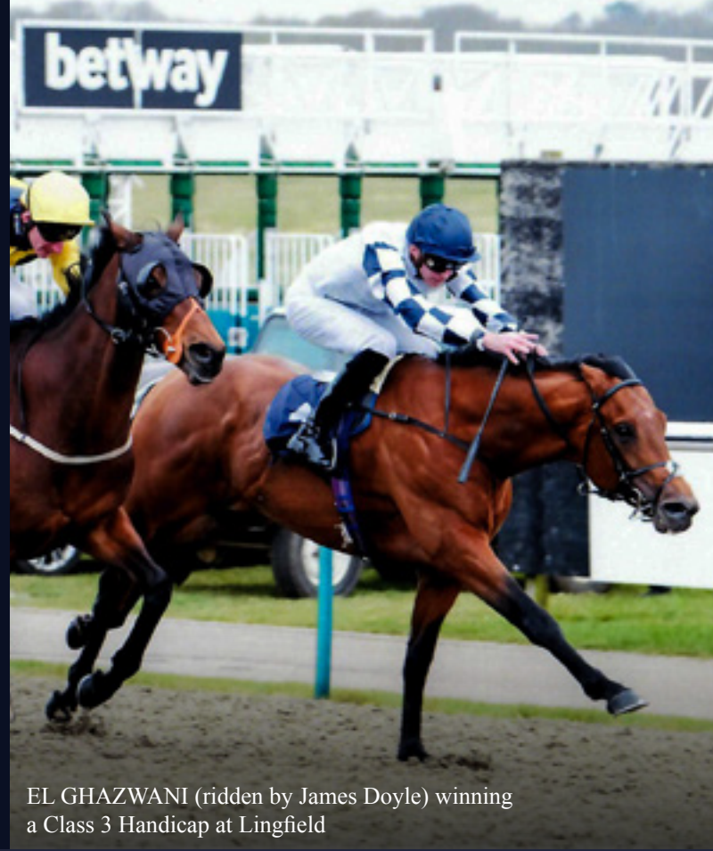
EL GHAZWANI (ridden by James Doyle) winning a Class 3 Handicap at Lingfield

COLLIDE (Frankel - Scuffle) won a Class 3 Handicap at Kempton on his first outing of the season for owner Prince Khalid Abdullah. The race was not run to suit and he showed class and a fantastic attitude, when coming off a very slow pace, to stay on gamely to win.